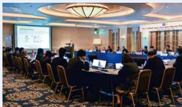
Japan-ASEAN Cybersecurity Policy Meeting