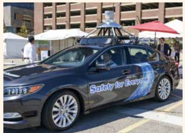
Demonstration experiment of self-driving cars