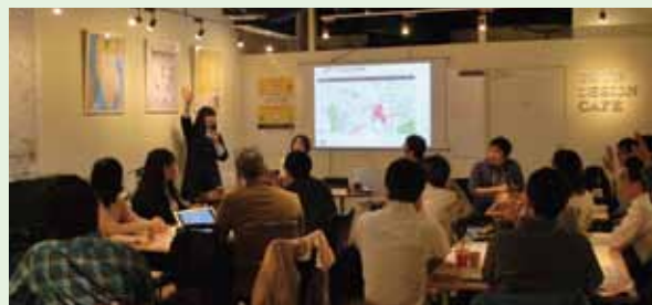
Interactive outreach and awareness raising seminar (Cybersecurity Cafe)