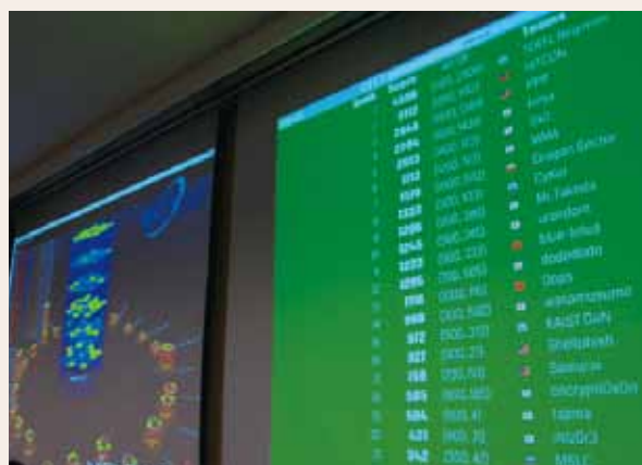
Security contest with 58 countries (2014)