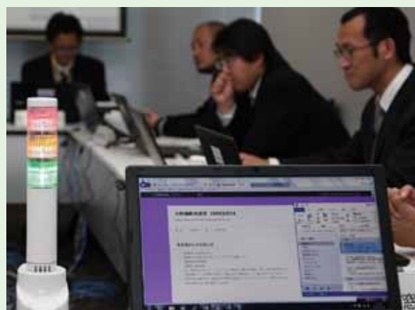
Exercises to improve cyber incident response capabilities (CII cross-sectoral exercises)