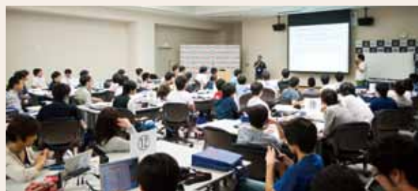
Cybersecurity Camp for the youth