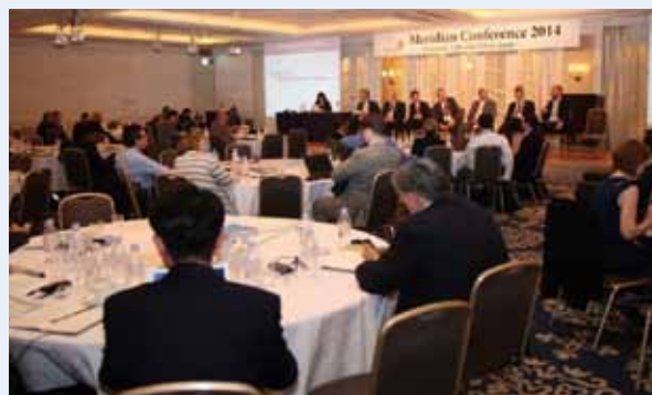
Meridian Conference 2014 in Japan